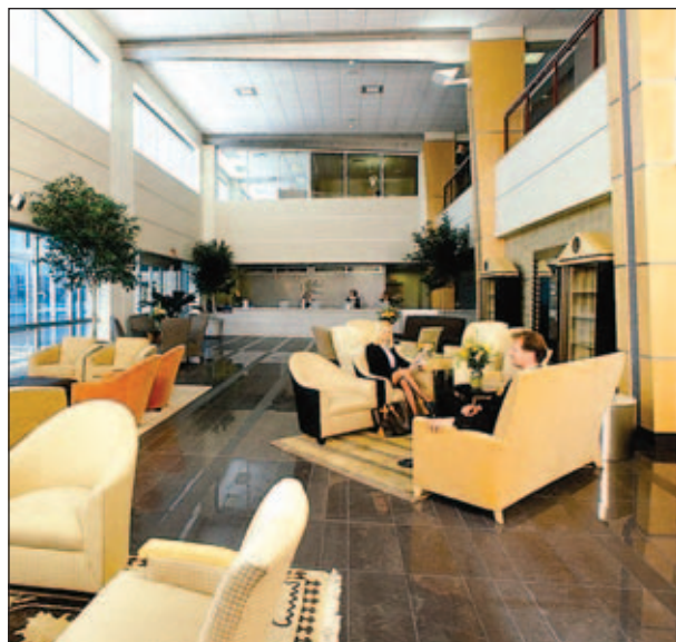
The inside lobby of Jet Aviation's Teterboro location, headquarters of Jet Aviation U.S. operations.