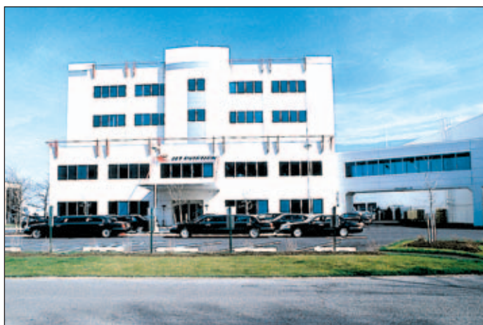
Jet Aviation's Teterboro FBO location has grown to be the highest volume business aviation facility in the world, in terms of gallons of fuel sold annually.

the company is now be able to accommodate Dassault Falcon 900 and 2000, Gulfstream V, Challenger 604 and Global Express aircraft and offer a second entry and exit point to the taxiways.