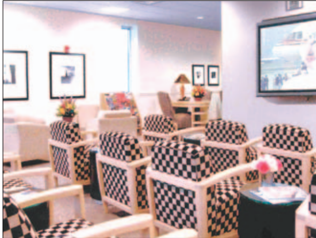
Teterboro's newly renovated pilot's lounge. Jet Aviation's locations worldwide are known for their elegant furnishings and European attention to detail.

Jet Aviation's London Biggin Hill location was recently named one of